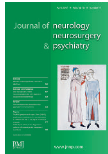
Miniature from Guido de Vigevano's work on anatomy showing trepanation