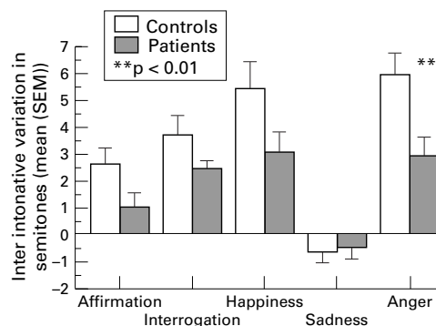
Figure 1 Interintonative variation of Fo. The bars represent the mean (SEM) values (in semitones) of the difference of Fo between each prosodic intonation and the neutral condition.