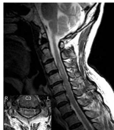
Figure 2 MRI scan of the patient.