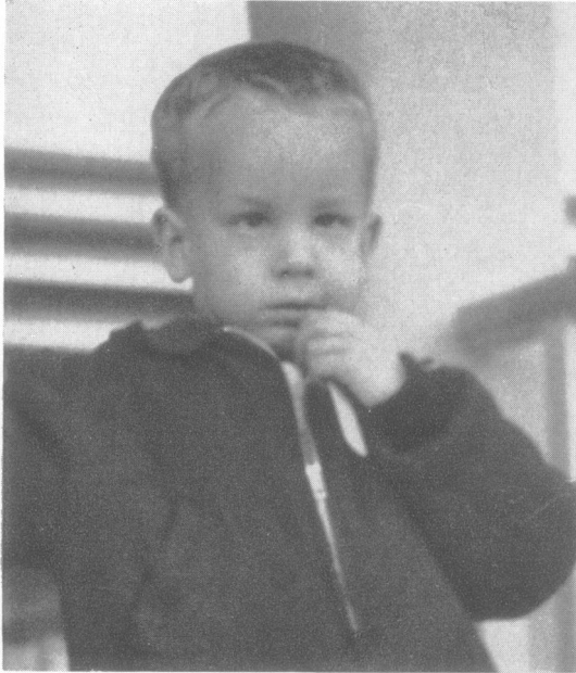
FIG. 2.—Patient photographed one year after surgery.