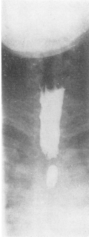
Fig. 1 Myelogram (AP) showing intradural extramedullary block at C6 level.

cause of spinal cord compression. It is more often seen in males during the first decade of life in the cervical region, and occasionally produces a relapsing clinical course (Neuhauser et al. , 1958) as seen in our case, rather than the progressive course reported by Despande et al. (1972). Interestingly there was a gap of five years between two episodes of neurological disturbance in our case. If untreated, enterogenous cysts may rupture into the spinal cord (Despande et al. , 1972) or the cyst wall may undergo peptic ulceration and haemorrhage (Wilkins and Odom, 1976). Complete or partial excision of the cyst has produced excellent results.