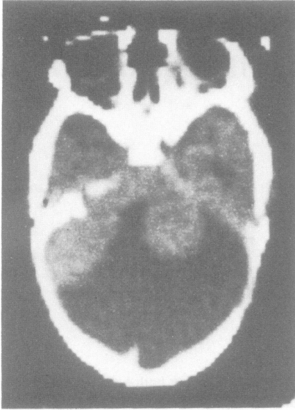
Fig 1 Case 1: CT showing a large cyst of CSF attenuation in the posterior fossa. Small remnant of brain tissue anteriorly on the floor of the posterior fossa. The cerebellar vermis is absent. The cerebellar hemispheres are hypoplastic.

cultures remained sterile. An EEG showed patchy irregular slow activity. A skeletal survey revealed postaxial polydactyly of hands and feet with supranumerary carpal bones, obtuse mandibular angles, upper cervical vertebrae with patent posterior arches, numerous wormian bones in the lambdoid sutures and a small midline defect inferior to the lambda. CT of the brain showed an enlarged fourth ventricle communicating with a midline cystic space extending to the cisterna magna (fig 2). Chromosomes were normal. Ultrasound examination of the kidneys showed no abnormality. All aspects of his development have been delayed: He smiled at three months, was able to lift up his chin at four months and followed with his eyes at ten months. He continued to have episodes of irregular respiration. When examined at 26 months he could hold his head upright but was unable to sit unsupported. He was generally hypotonic and tendon reflexes could not be elicited. He had developed a roving nystagmus, he reacted to auditory stimuli but had not started speaking. The head circumference was below the 2nd centile. A repeat CT scan showed no change compared to the previous one and ERG and VER were normal.