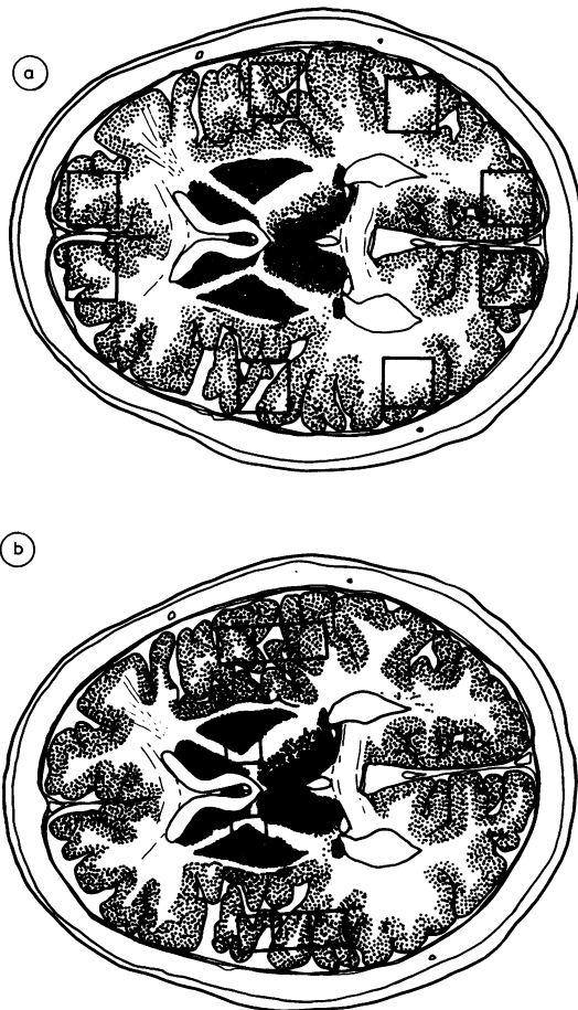
Fig 1 Showing regions of interest in (a) frontal, temporal and occipital lobes; and (b) temporal cortex, examined at slice OM + 4.

tal regions on two slices at OM + 4 and OM + 6 (Fig 1). A cerebellar region was chosen on the OM + 2 slice. Additional areas of 1.5 cm 2 were analysed in the temporal cortex and basal ganglia of the patients. Statistical analysis, comparing patients with epilepsy to normal subjects was by Student's t test.