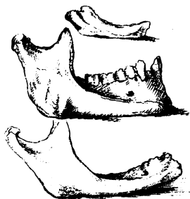
Figure 2 Mandibles of infant (top), adult (middle) and elderly person (bottom) by Charles Bell. 4