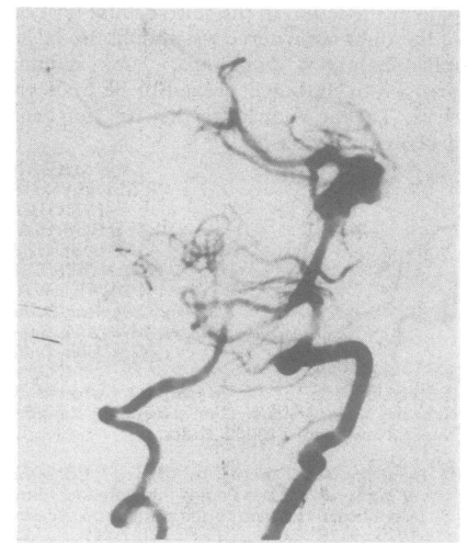
Figure Vertebral angiogram showing both vertebral arteries, the basilar artery, and the aneurysm arising from the basilar bifurcation.

Department of Neurosurgery, Newcastle General Hospital, Westgate Road, Newcastle upon Tyne NE4 6BE, UK