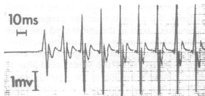
Figure Incremental increase in the compound motor action potential of the left abductor digiti minimi on repetitive stimulation of the ulnar nerve at 50 Hertz.

normal in two nerves; c) CMAP ratio from proximal and distal stimulation less than 0.7 in the right median and left ulnar nerves recorded on day 21; d) A reduction of both ulnar sensory action potential amplitudes below 80% of the lower limit of normal; d) F wave latency prolongation from day 7, increasing to 120% of the upper limit of normal by day 21.