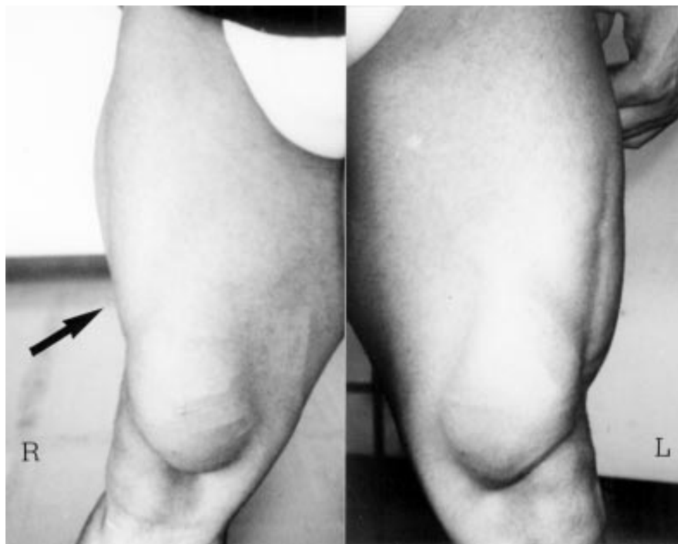
Figure 1 Atrophy of the distal portion of the vastus lateralis muscle (see arrow) on the right side of a body building champion; on the left side the vastus lateralis muscle was normal.

Received 20 February 1997 and in revised form 19 May 1997 Accepted 30 May 1997