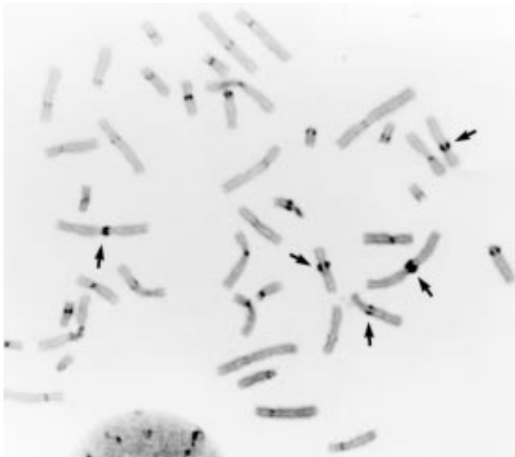
Figure 3 C banded metaphase from the patient. All the chromosomes show the typical Roberts' syndrome effect, with centromere division and chromatid puffing (repulsion) in areas of constitutive heterochromatin (arrows indicate typical ones).

On admission, she was a thin, short woman; 138 cm in height and 29 kg in weight. She had a relatively small face and head with a maximum head circumference of 47 cm and looked older than her actual age. She had no obvious physical anomalies of her body or limbs except for a mild high arched palate. The physical examination was not informative, including secondary sex characteristics (fig 1). Although her responses were slightly slow, she was alert and cooperative. Her intelligence score was 67 on the Wechsler adult intelligence scale.