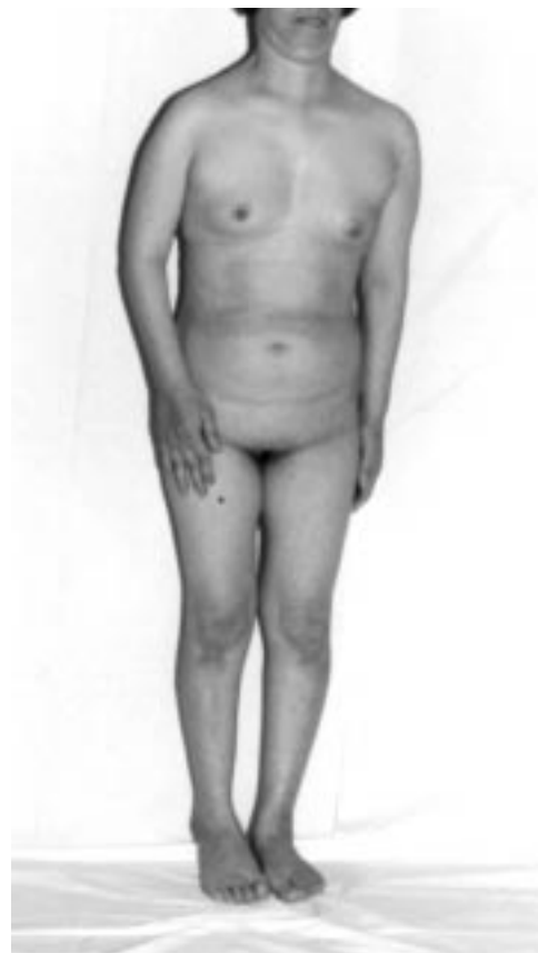
Figure 1 Patient at 45 years of age. She had no obvious physical anomalies of her body or limbs.

When she was 28 years old, she began to fall asleep for two to five days without any prodrome. After finishing the somnolent period, she could work in the factory at the beginning of the illness. However, the duration of the hypersomnia became longer within two years. She slept for almost three weeks and this was followed by the same duration of wakefulness. During the somnolent period, she slept continuously unless her mother woke her to eat light meals and for urination. When she awoke in remission, she ate much and stayed awake until midnight and this was followed by three to five hours of listlessness to a drowsy state. The