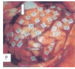
See p 512