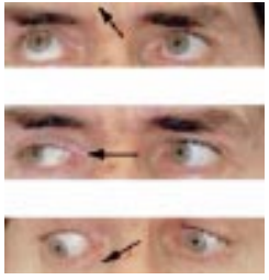
See p 519