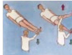
See p 242