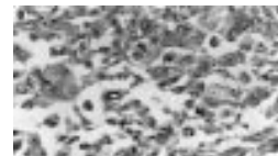
See p 337