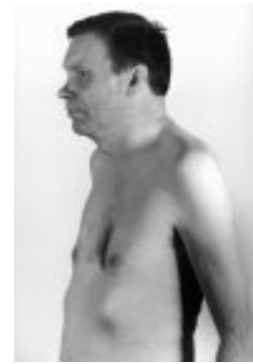
See p 324