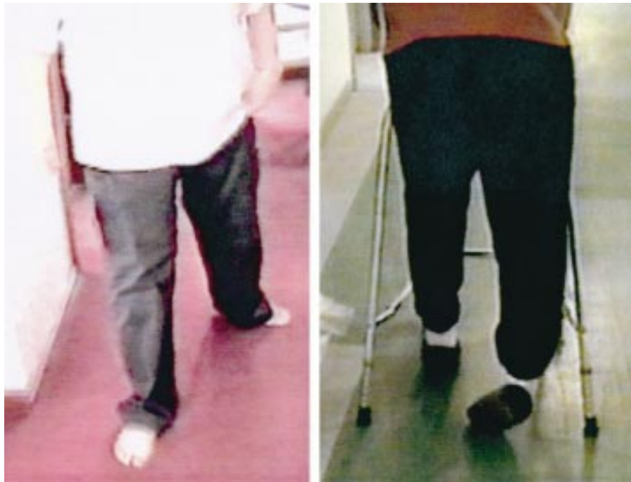
Figure 2 Functional monoplegic gait. In both cases the leg is dragged at the hip. External or internal rotation of the hip or ankle inversion/eversion is common.

the examiner overcomes the muscle force is unusually high when compared with the force generated by normal resistance. 11 Another study confirmed that patients with functional weakness produce significantly variable amounts of force in their limbs compared with controls. This study also showed that subjects with functional weakness tend to produce less force with slower movements. 12