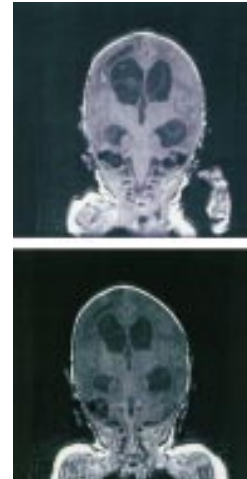
See p 659