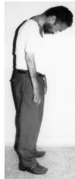
See p 685