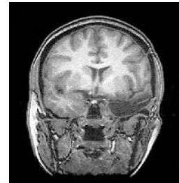
See p 593