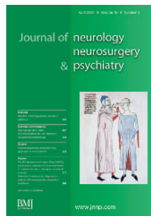
Miniature from Guido de Vigevano's work on anatomy showing trepanation

• Periodicals postage paid, Rahway, NJ. Postmaster: send address changes to: Journal of Neurology Neurosurgery and Psychiatry , c/o Mercury Airfreight International Ltd, 365 Blair Road, Avenel, NJ 07001, USA