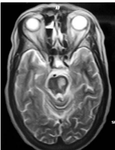
Figure 2 T2 Weighted magnetic resonance image showing an acute left ponto-mesencephalic infarct.

(one week after the onset of symptoms) showed an acute infarct at the left ponto-mesencephalic junction (fig 2). At follow up 10 days later, her gait had improved. Her episodic symptoms had disappeared.