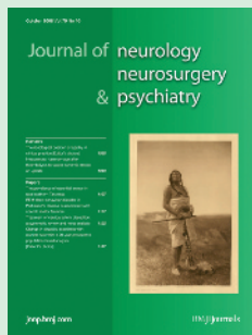
Cover image: Medicine man