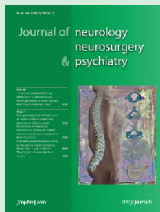
Cover image: Types of vertebrae viewed from above