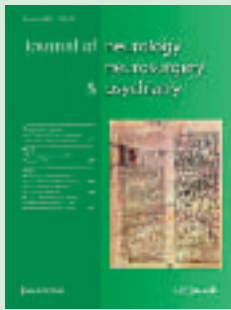
Cover image: The Hippocratic Oath