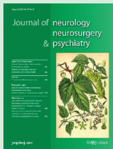
Cover image: Humulus Lupulus L