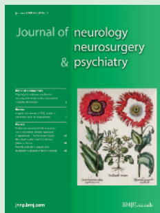
Cover image: Opium