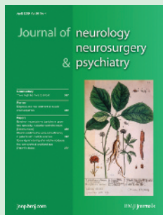
Cover image: Ginseng