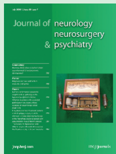
Cover image: Electromagnetic machine