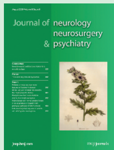
Cover image: Henbane