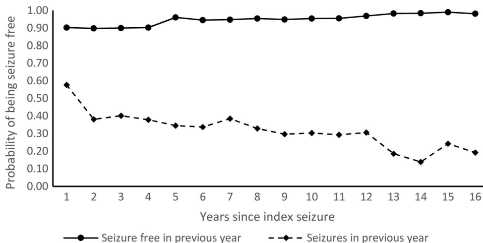
Figure 2 Probability of seizure-freedom each year based on presence or absence of seizures in the previous year (N=568 with follow-up of at least 2 years).

Apart from the NGPSE, there are only two other population-based studies with a longitudinal cohort larger than 250 participants, only one of which one has follow-up for >10 years. 2 14 15 The percentages of people in terminal remission in previously reported studies range between about 44 and 70%. 2-5 16 Earlier analysis of the NGPSE, also excluding people with acute symptomatic seizures and excluding those with a single seizure at presentation found that 60% (95% CI 52% to 68%) had had a 5-year remission (not necessarily terminal remission) by 9 years. 17 We found higher figures (80% in 5-year terminal remission in people with epilepsy at presentation followed to 2009). This may be influenced by the long follow-up in this study, with the proportion seizure-free each year consistently greater than 80% after 6 years. This finding of higher