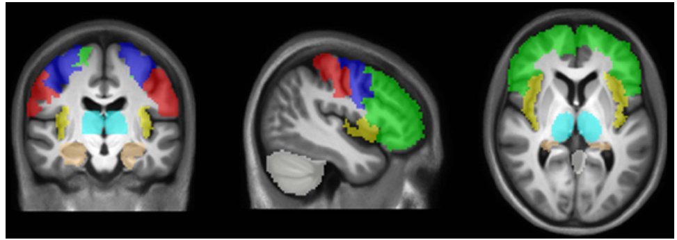
Figure 1 A priori defined regions of interest. A priori defined regions that were used in the present study: cerebellum, insula, precentral gyrus, postcentral gyrus, prefrontal cortex, medial temporal lobe and thalamus. Regions are overlaid on the cohort-specific MNI-space template ( x=-43 , y=3 , z=-15 ).

for these regions were created by using Freesurfer to automatically segment the MNI-space cohort-specific T1-weighted template. 26, 27 For each GM ROI and in each patient, the total GM lesion volume and the GM volume were extracted from the VBM and LPM images, and co-localisation between atrophy and lesion load was assessed using linear regression analyses, correcting for age, sex, and ICV.